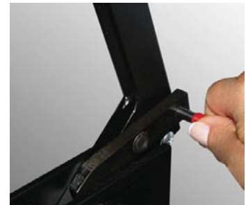
Safety Blade Latch