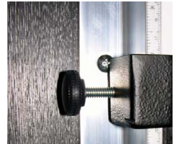
Adjustable Paper Stop