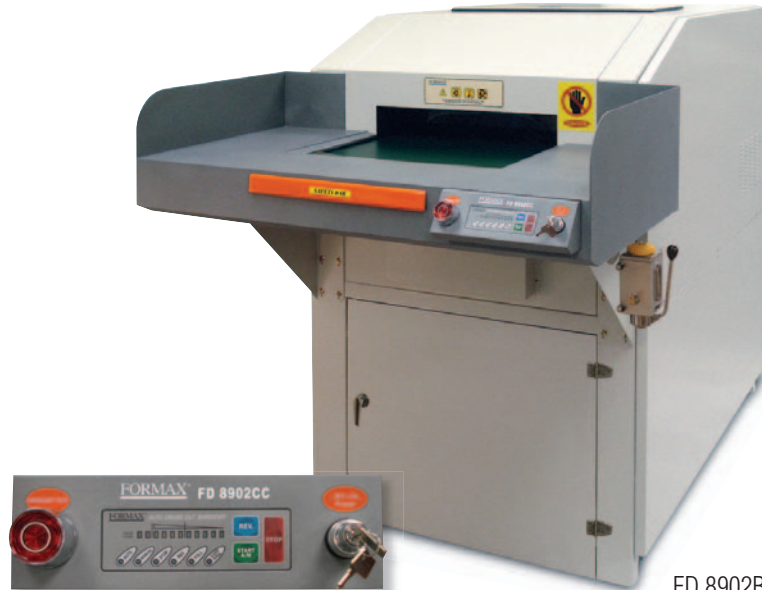
LED Control Panel with Load Indicator

414-345-6000 800-543-4366 www.dusa.com email: info@dusa.com