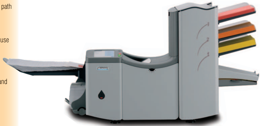
Shown with optional conveyor