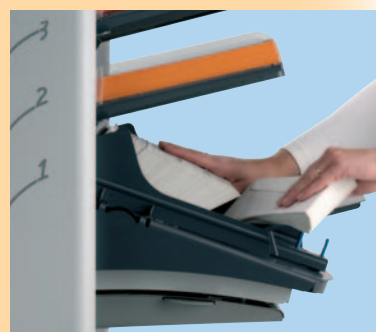
Optional Production Feeder holds 325 BREs or 1,200 sheets