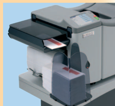
Optional Side Exit Tray