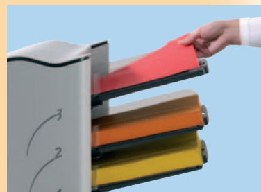
Horizontal feeders offer a loading capacity of up to 325 sheets each