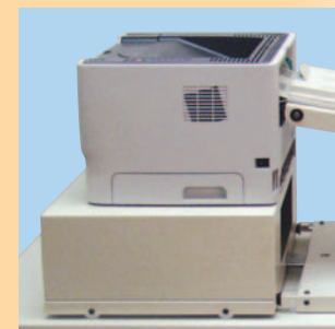
FD 2000-45IL Riser with HP/Troy P2015 Printer

** Dimensions include IL Pressure Sealer and IL Alignment Base (both included) and laser printer (not included in system)