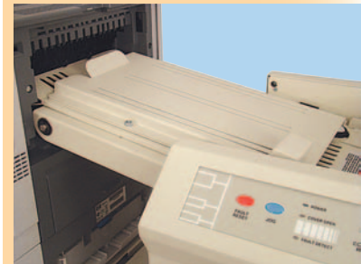
Enclosed paper path provides optimal document security