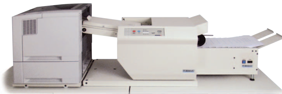
FD 2000IL System shown with IL Pressure Sealer and IL Alignment Base, laser printer (not included), optional conveyor and optional locking cabinets

414-345-6000 800-543-4366 www.dusa.com email: info@dusa.com