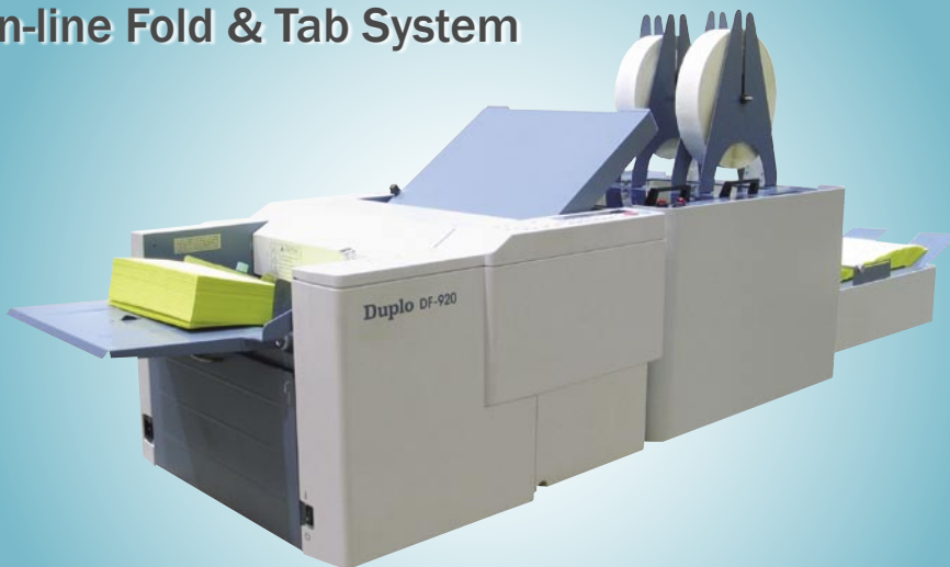
Duplo DF-920 FOLDER In-line with DT-900 TABBER

Duplo ® THE ON DEMAND DUPLICATING/FINISHING SOLUTION