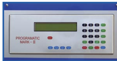
The easy-to-read digital display guides you through all programming operations and cutting positions.