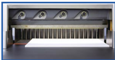
Simple knife changes are conveniently made from the front of the machine rather than the side.

Production rates are based on optimal operating conditions and may vary depending on stock and environmental conditions. As part of our continuous product improvement program, specifications are subject to change without notice.